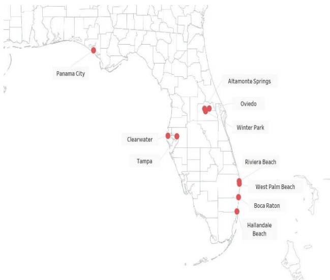
2014 Circuit Rider Pilot Locations